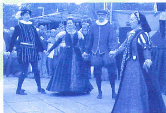
Edinburgh Early Dancers

performances during this year's Edinburgh Military Tattoo, proved to be some of the best in the world.