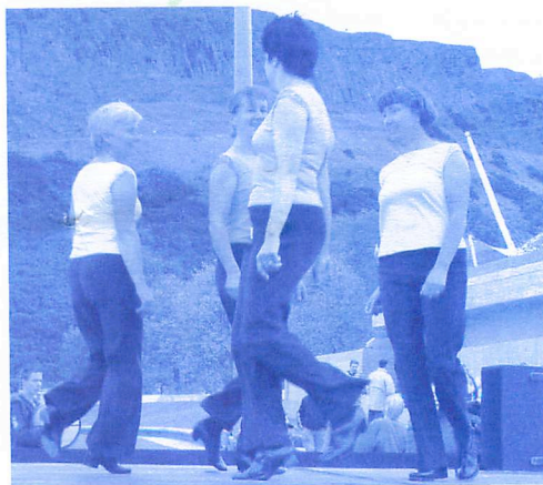
Inverkeithing Step Dancers

Edinburgh Tattoo Highland Ceilidh Dancers, highly polished and fresh from their