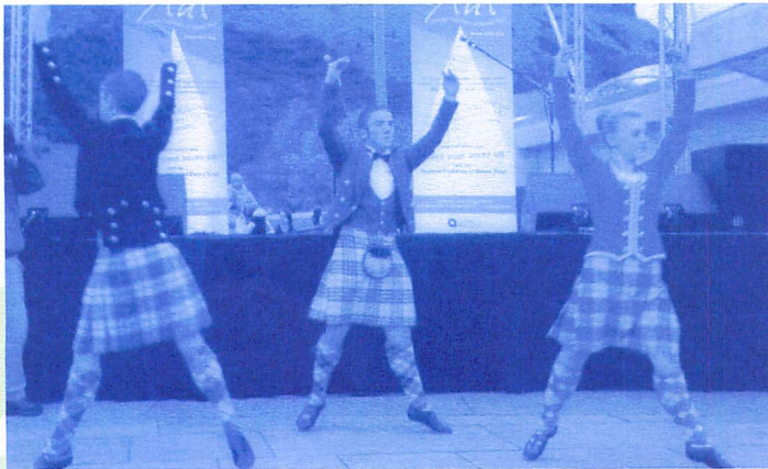
3 World Champions

As part of an ongoing partnership development between STDT and the National Museum of Scotland, STDT provides two x half-hour performances in a traditional dance style on the 1st Sunday of each month, in Hawthornden Court within the National Museum of Scotland. Entry to the Museum and attendance and the performances is free. The idea is to give a performance of Traditional Scottish Dance and then to encourage some participation from the audience.