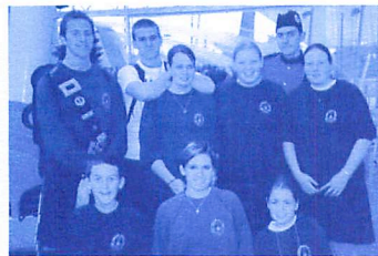
Queen Victoria School Display Team