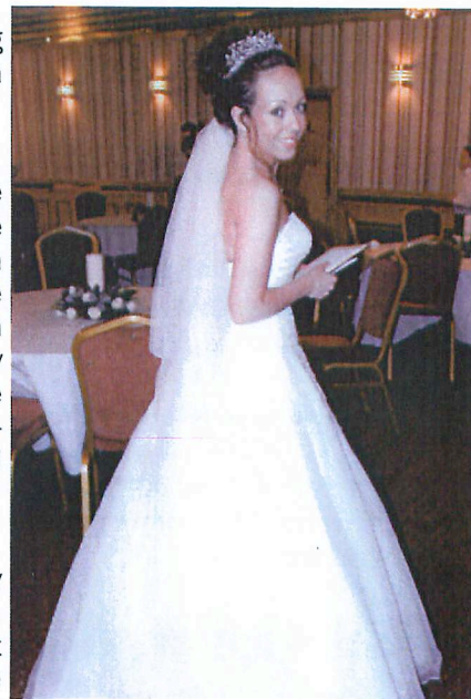
Awww! Wasn’t she beautiful?