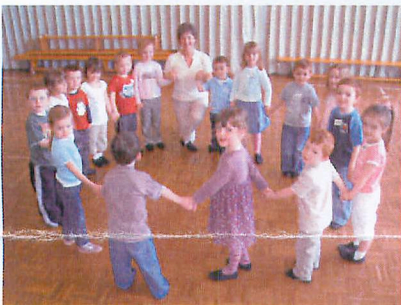
Leuchars Nursery School

I also organised 4 schools ceilidhs to round off the workshops, including dance demonstrations held in Newport, Anstruther, St Andrews & Glenrothes involving 22 schools.