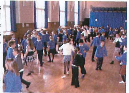
Schools' Ceilidh, St Andrews

Successful summer dance workshops were held in Auchtermuchty and Glenrothes for children aged 7 - 14 years with 61 participants and Highland dance sessions were provided during the RSCDS Summer school held in St Andrews with members from Canada,