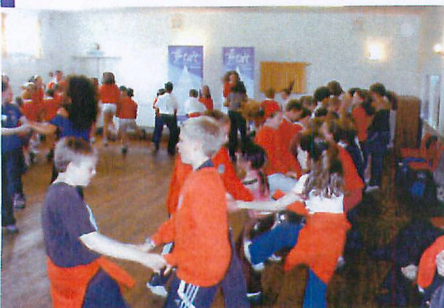
Girvan Dance Day Ceilidh, June 07