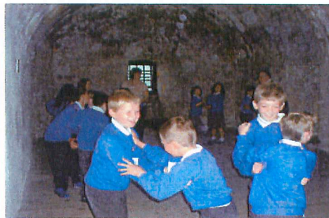
What? Boys enjoy a Historic Dance class?!?